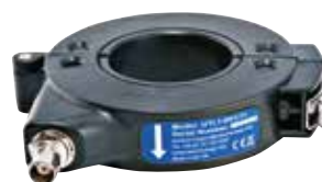
Radio Frequency Current Transformer (RFCT)