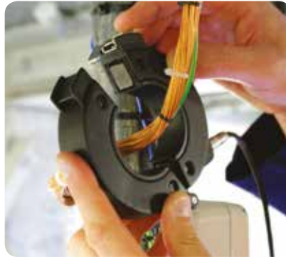
2. Clip On