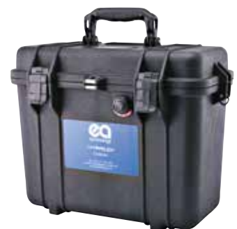
Rugged carry case