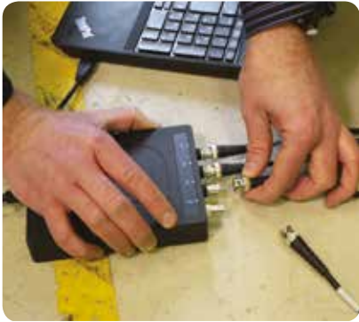
1. Plug In